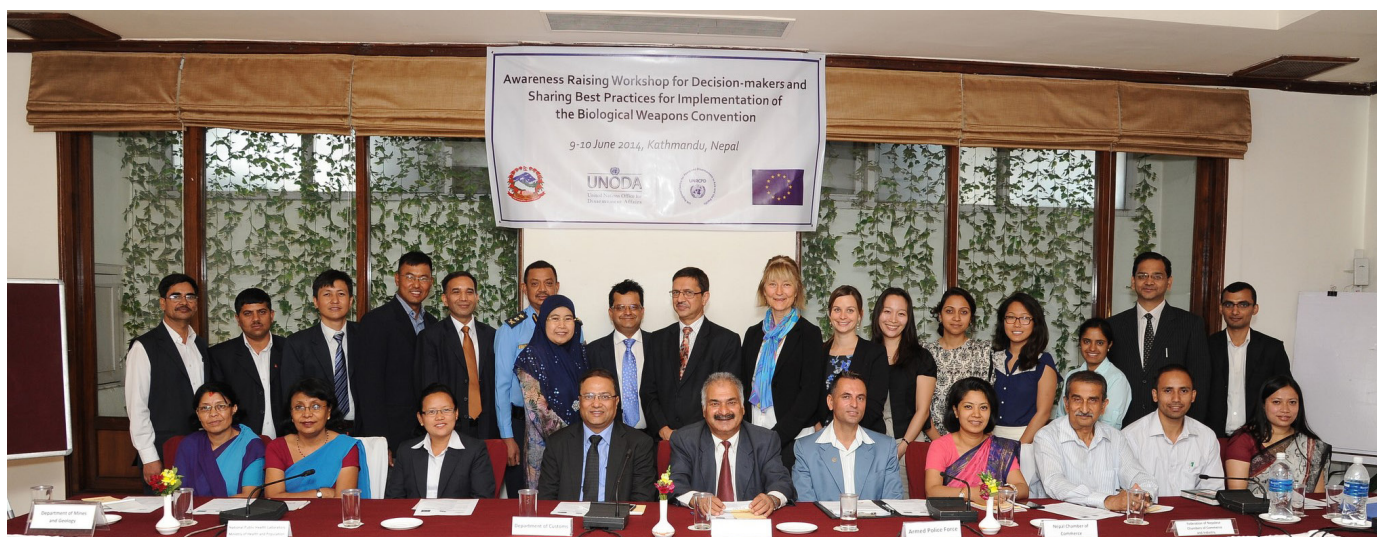
Workshop to Support the Implementation of the Biological Weapons Convention, Nepal, 2014

The Regional Centre assisted Member States in their efforts to effectively implement Security Council resolution 1540 (2004), which aims to prevent access by non-State actors to nuclear, chemical or biological weapons and their means of delivery, including related materials. To promote the safety and security of such materials, UNRCPD provided support with roundtable discussions, preparation of national action plans, enhancement of national legislation, adoption of national control lists, strengthening and enforcement of domestic control mechanisms, and provision of training and educational activities. The Centre further assisted individual States in developing their 1540 National Implementation Plans or in preparing their first 1540 national implementation reports. The Regional Centre also supported efforts for the implementation and universalization of the Biological Weapons Convention and the Chemical Weapons Convention at the regional and sub-regional levels.