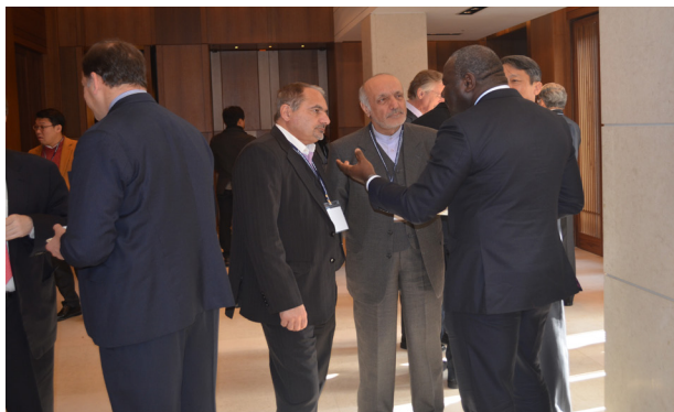
United Nations - Republic of Korea Joint Conference on Disarmament and Non-proliferation Issues, Seoul, 2015

UNRCPD collaborates with the Governments of Japan and the Republic of Korea to organize two annual conferences on disarmament, non-proliferation and security issues, providing important fora to address pressing international challenges in these areas at both global and regional levels.